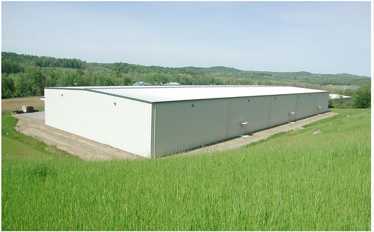
REAR VIEW OF BUILDING