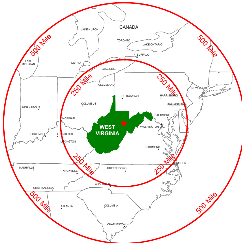
250 & 500 MILE RADIUS FROM BELINGTON, WEST VIRGINIA