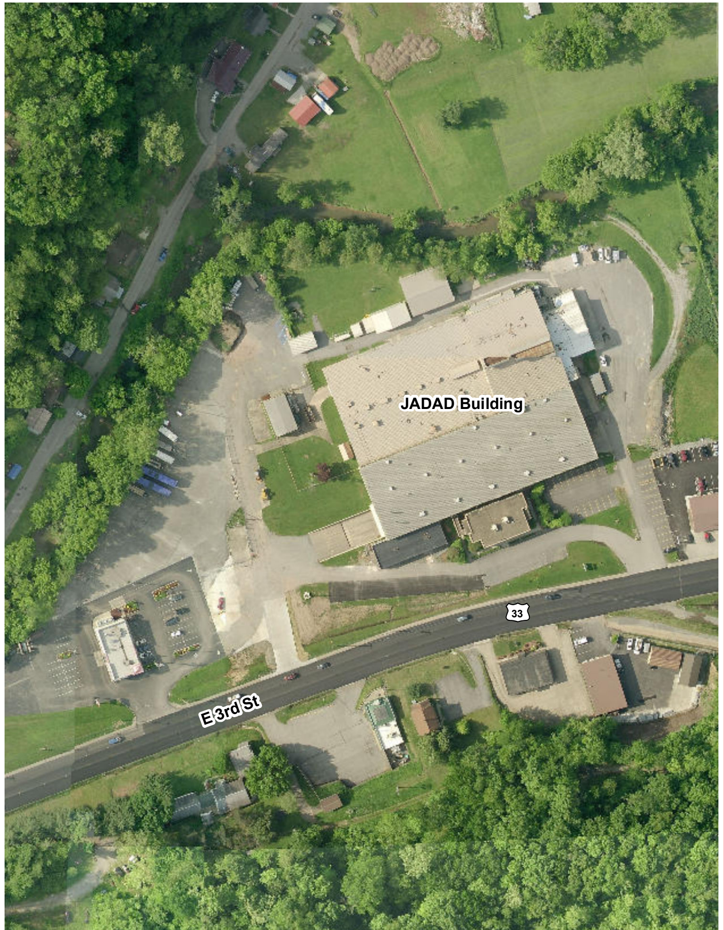
BUILDING LOCATION IN WESTON, WEST VIRGINIA