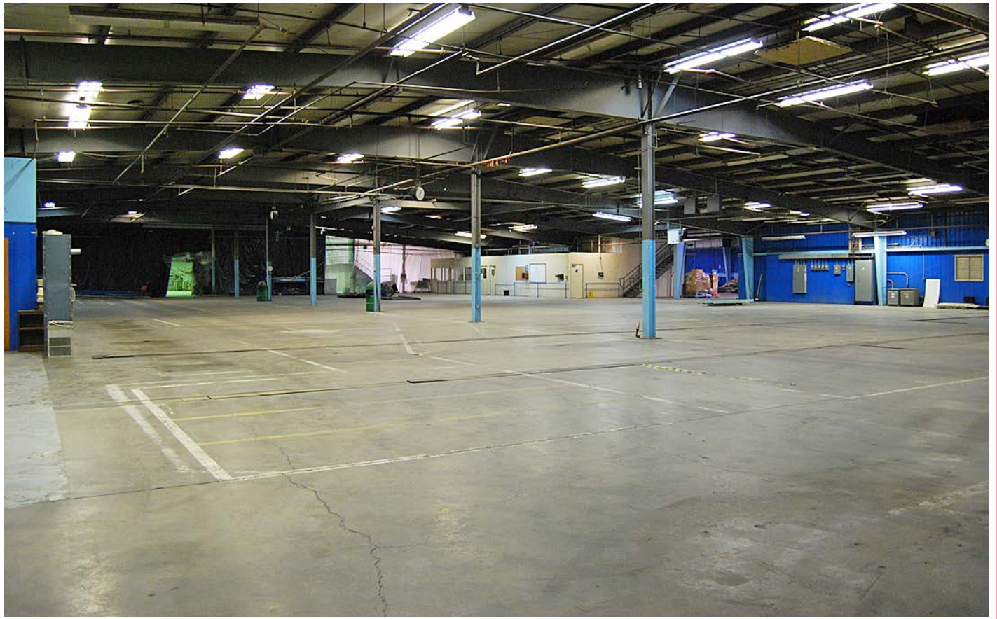
AVAILABLE SUITE 2 - 28,000 SQ. FT.