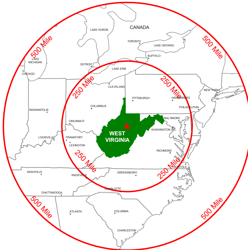
250 & 500 MILE RADIUS FROM WESTON, WEST VIRGINIA