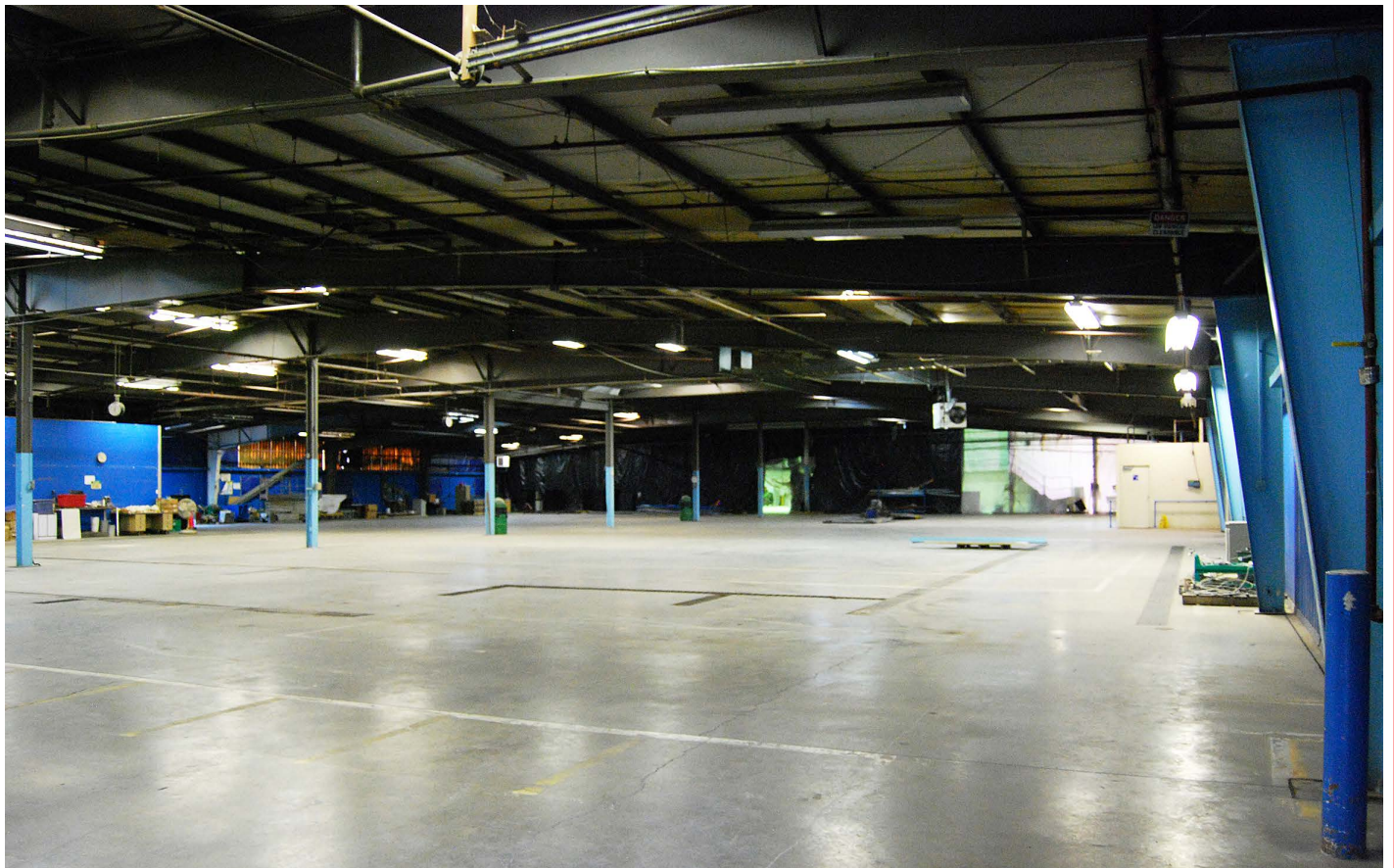
AVAILABLE SUITE 2 - 28,000 SQ. FT.