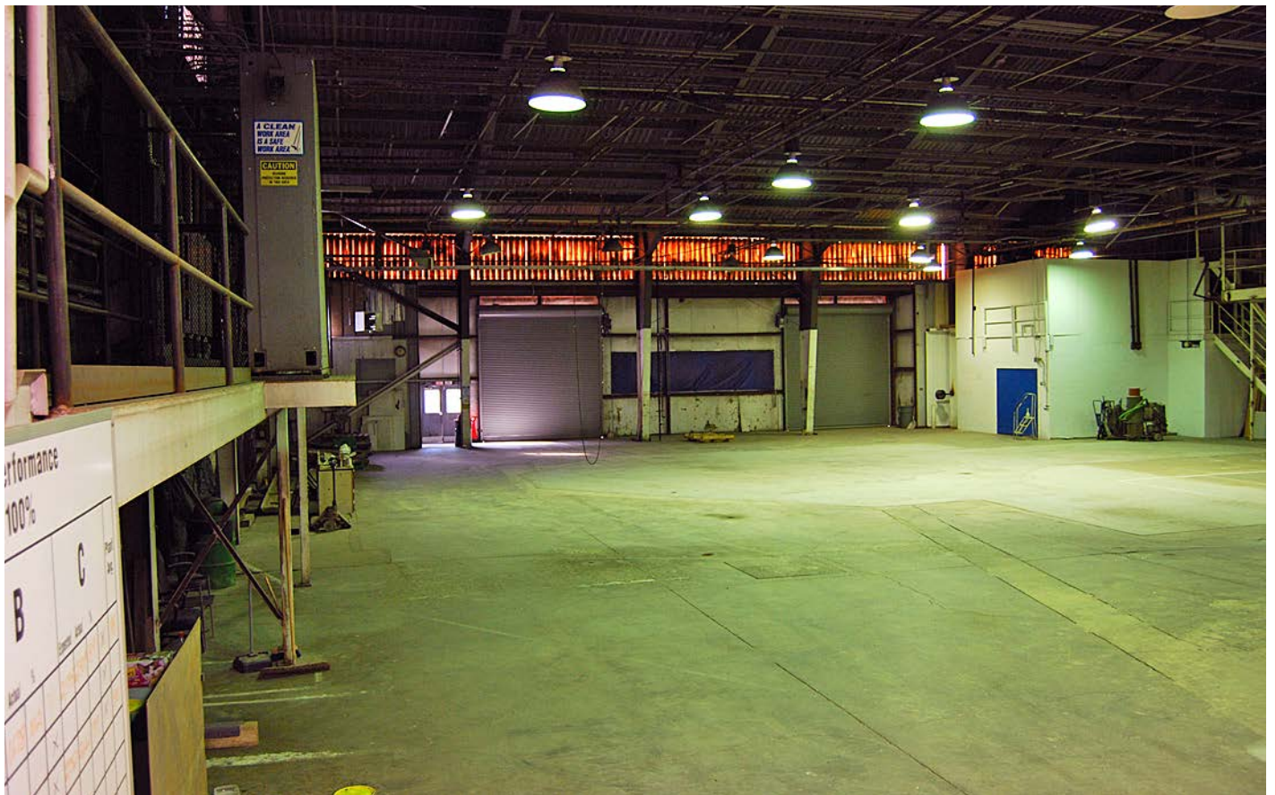
AVAILABLE SUITE 3 - 8,500 SQ. FT.