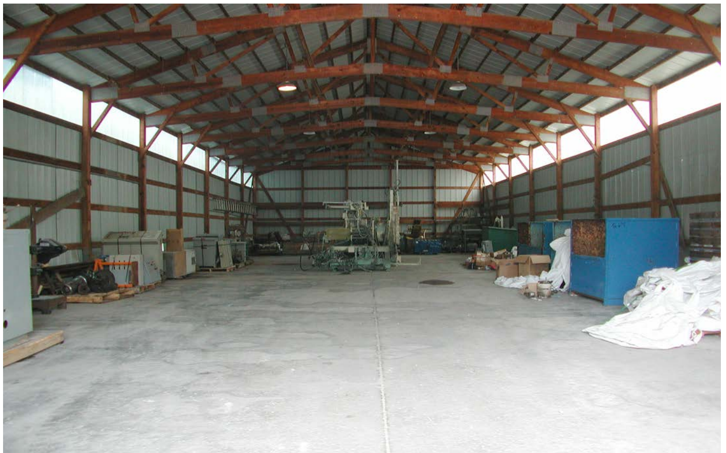
INTERIOR VIEW OF STORAGE BUILDING THREE