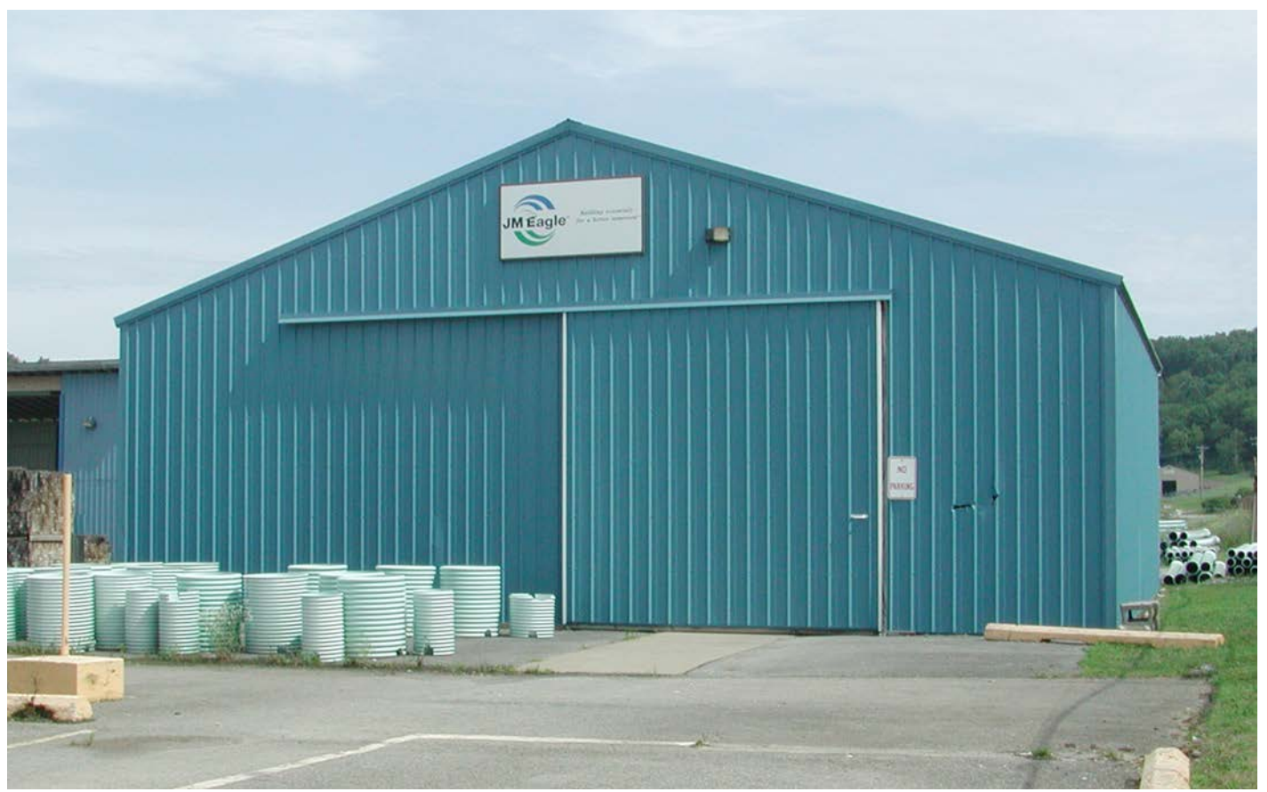
STORAGE BUILDING ONE (40' X 40')