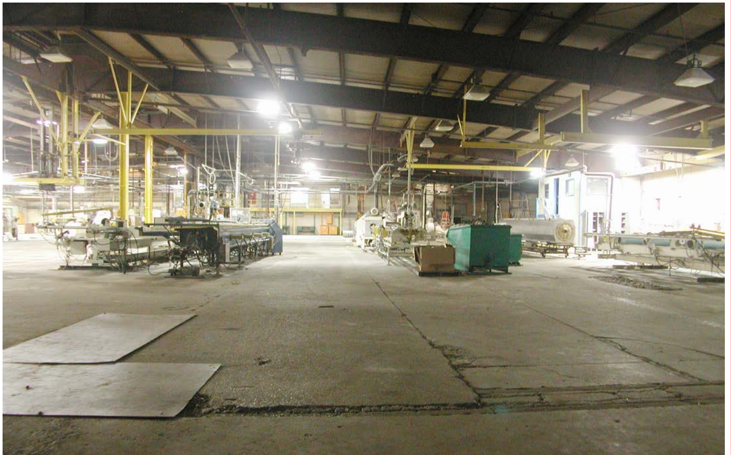
BUILDING ONE (BAY TWO)