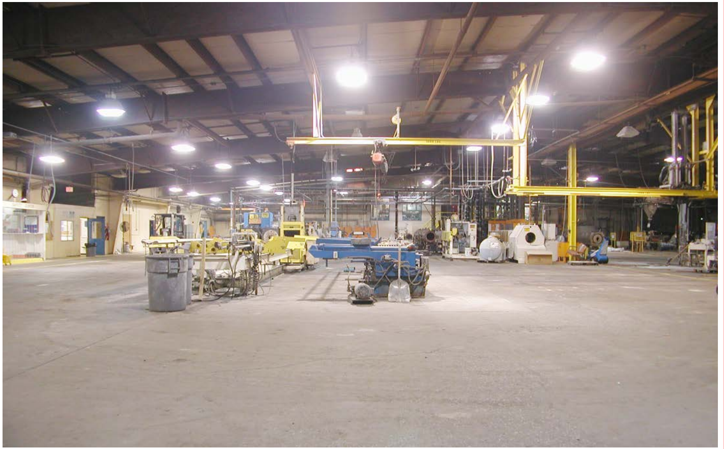
BUILDING ONE (BAY ONE)