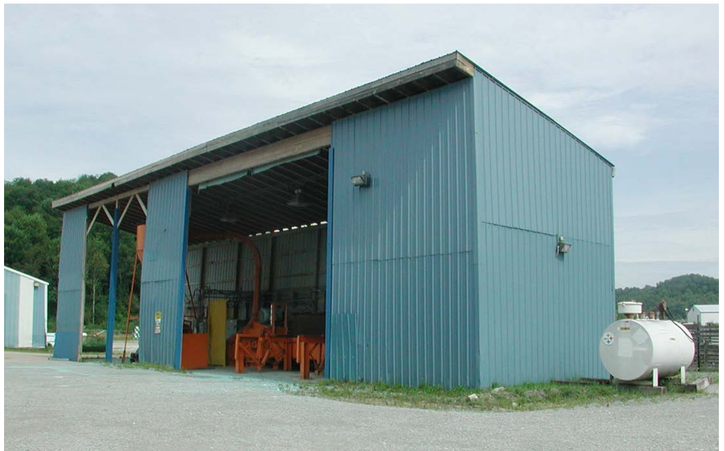
STORAGE BUILDING TWO (19' X 76')