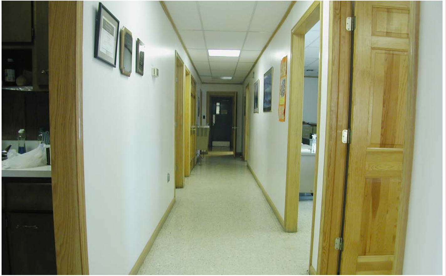
OFFICE SPACE CORRIDOR