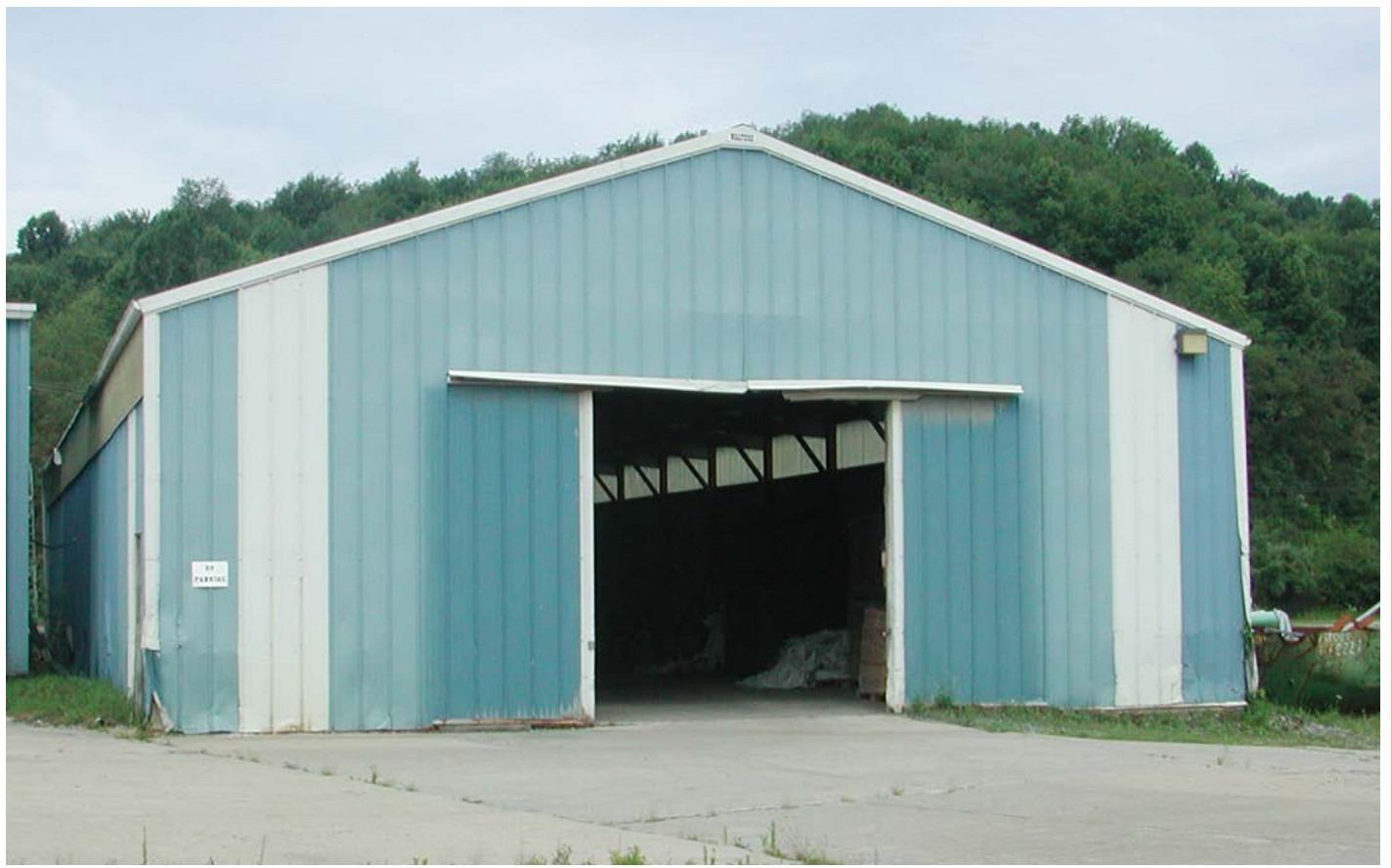
STORAGE BUILDING THREE (42' X 100')