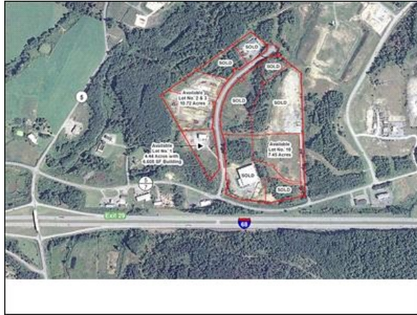
Northpointe Business and Industry Park